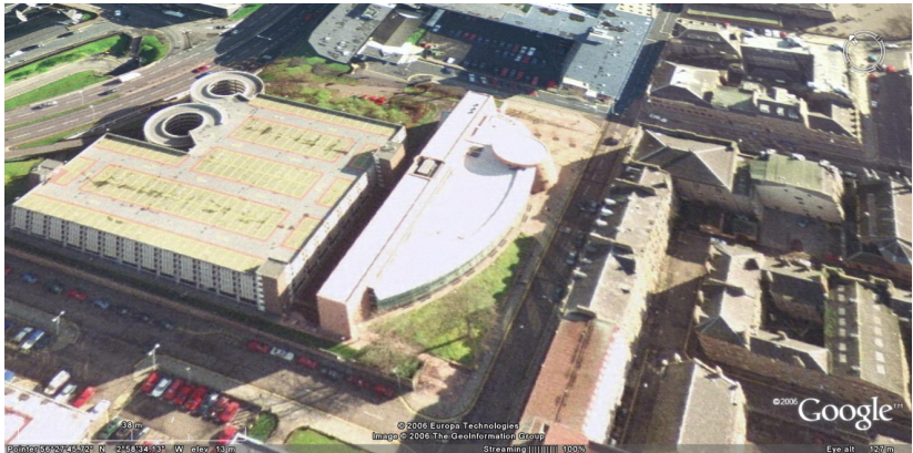
Figure: Google Earth™ Screenshot