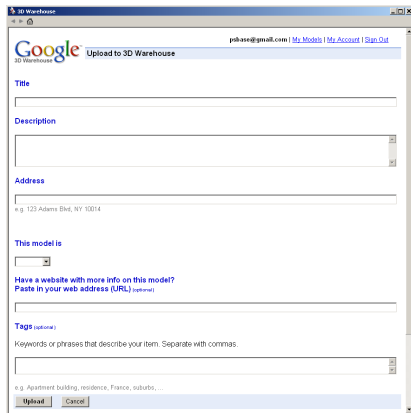
Figure: Google SketchUp™ Screenshot